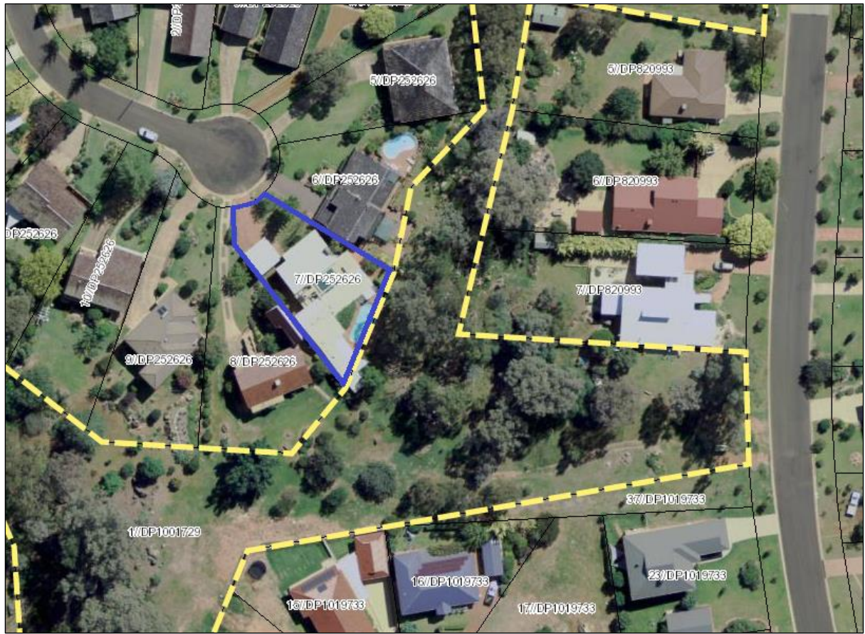
Figure 2: Aerial imagery of the affected land, showing 7 Yarrawonga Crescent (blue boundary).