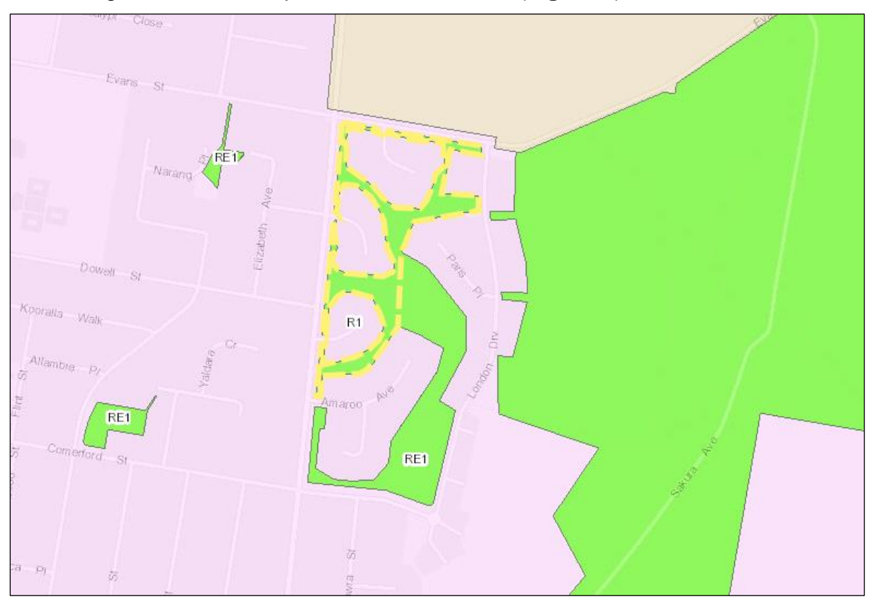
Figure 1: Extent of Lot 1 DP 1001729 (yellow boundary) showing RE1 Public Recreation zone

dwellings, there may be other instances of private structures encroaching onto the public reserve. This proposal will only address the encroachment of structures from 7 Yarrawonga Crescent onto part Lot 1 DP 1001729 ( Figure 2 ).